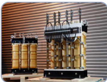
The technology inside basic Voltage Optimisation