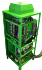
The technology inside Dynamic IQ Controller